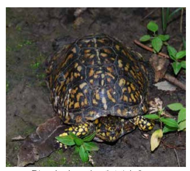
This one for reference shows the typical yellow squiggles the we see on most of the turtles we find. I found it at Delshire in September of 2018.

My interest in Box Turtles was first kindled by the many turtles I found as I wandered around the woods near my boyhood home in what is now the Turkey Haven Preserve of Western Wildlife Corridor. We would pick them up, check out the beady red or brown eyes, let the dog sniff them, and put them back on the ground.