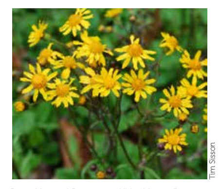
{\it Round Leaved Ragwort-Kirby Nature\ Preserve}

Special Thanks to the Duke Energy Foundation for their support of the Kirby Nature Center Playscape. Their gift will help us provide children with access to the outdoors by completing the construction of the ADA prairie pathway, creating children activity stations, installing signage, and more.