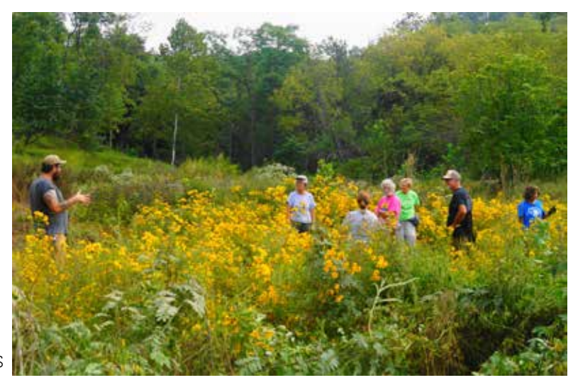
Volunteers in the Prairie — Kirby Nature Preserve

On average, volunteers have been putting in about 5,000 hours/year. That's a lot of hours, equivalent of more than 2 full-time staff persons! Thanks to everyone who contributed! And thanks to all of the anonymous volunteers whose contributions are not tracked