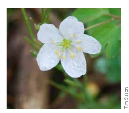
{\it False Rue Anemone-Kirby Nature Preserve}