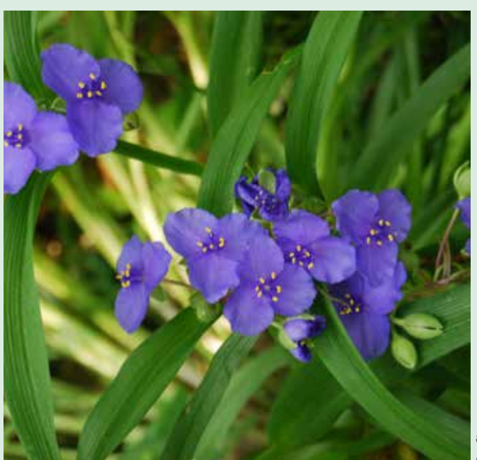
Virginia Spiderwort — Bender Mountain Nature Preserve

Right now, there is a unique opportunity to create three new forested preserves: The Muddy Creek Preserve, Riverside Community Preserve, and Sayler Park Sisson Preserve. Protecting and restoring these areas is one step closer to realizing the vision of a wildlife corridor stretching along the Ohio River from the Mill Creek to the Great Miami River. Spring fills us with hope for the year ahead, and thanks to our leaders, volunteers, and supporters, we are confident that together, we will continue to grow.