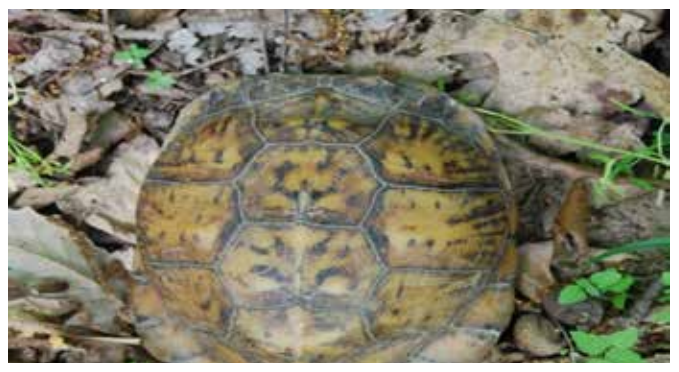
This one that I found at Buckeye Trace in April 2021 is mostly covered in yellow.

The numbers show that the Eastern Box Turtle population is doing very well in the Western Wildlife Corridor, and we have even observed baby turtles in recent years. The large population indicates that our preservation efforts are working and the Eastern Box Turtle will always have a home here. By protecting and preserving the wooded hillsides that turtles find so welcoming, we assure their survival into the future.