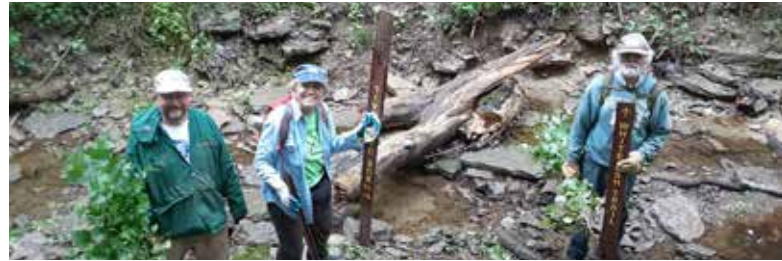
Volunteers at Delshire Nature Preserve

We also plan to host an AmeriCorps NCCC team comprising 7-10 individuals between the ages of 18-24 who are completing a year of volunteer service. The team will spend 6 weeks this summer and dedicate about 2,000 volunteer hours restoring habitat, building trails, installing signs, and coordinating volunteer events. To learn more about AmeriCorps NCCC, go to AmeriCorps.Gov/NCCC.