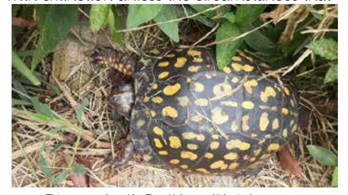
This one was found by Tom Malone at Kirby in August of 2021. I call it the polka-dot style. This style has been encountered several times, but is not common.

The Eastern Box Turtle ( Terrapene Carolina Carolina ) is one of 6 extant subspecies of the common box turtle. The brown shell has markings which can be orange, yellow, or red or any combination of these colors, which provide camouflage among the leaves on the forest floor. The Eastern Box Turtle is classified as a vulnerable species by the International Union for Conservation of Nature, being threatened with extinction unless the circumstances that