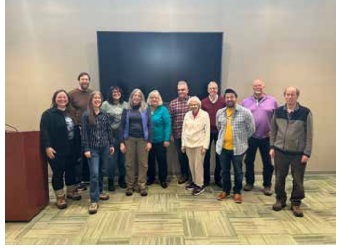
Our Board Retreat

Many of our 2025 organizational goals will be