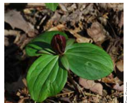
{\it Sessile Trillium-Kirby\ Nature\ Preserve}