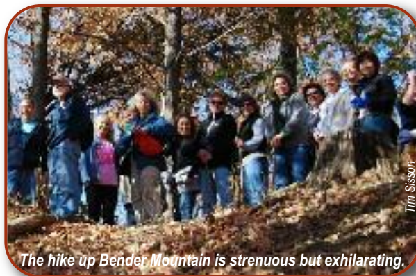
The hike up Bender Mountain is strenuous but exhilarating.

The trees should be at the peak of fall color, so this is your opportunity to see them if you can't be at the hike on Saturday. Meet at the barrier at the end of Delhi Pike near the College of Mount St. Joseph. The first part of the hike will be on the portion of Delhi Pike that was closed years ago due to hill slippage, but still makes a nice hiking path (commonly called Sister's Hill). The second (optional) part of the hike climbs a strenuous new trail we've recently blazed up from Hillside Avenue to the top of Bender Mountain to reach old-growth forest and a nice view of the Ohio River. Contact Bruce at 513.451.5549 with questions.