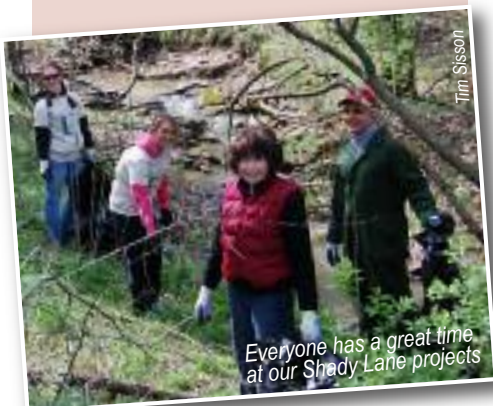
Everyone has a great time at our Shady Lane projects