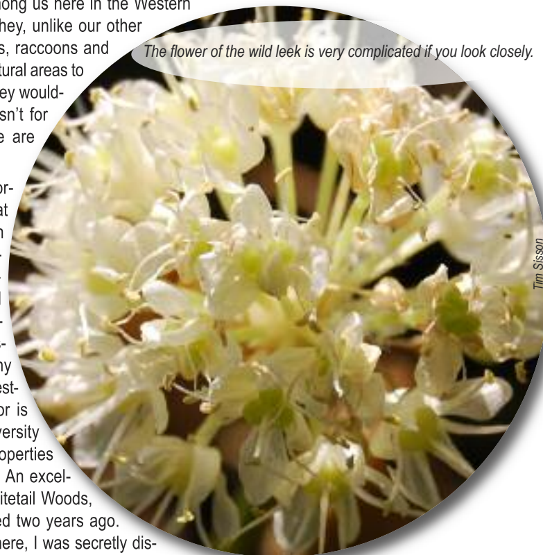
The flower of the wild leek is very complicated if you look closely.

A plant that we don't see much in our area was brought to mind when I saw a Giant Swallowtail ( Papilio cresphontes ) recently on Bender Mountain. The host plants for this swallowtail are members